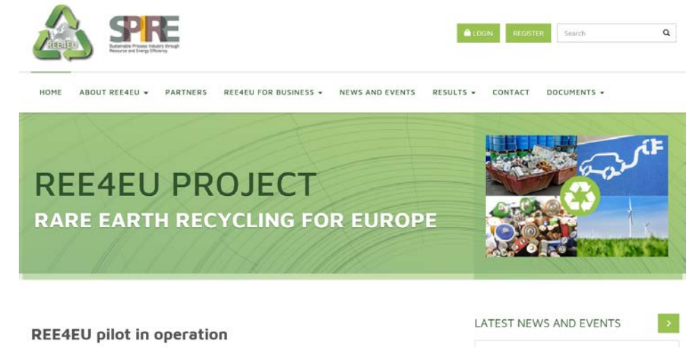
Figure 2. Snapshot of the REE4EU's project website, www.ree4eu.eu

The external project website was created and managed by partner PNO-Italy Ciaotech (third linked party of partner PNO-Innovation). The consortium took advantage of the often updates of "Events", gathering relevant Conferences and Workshops in the field of recycling, critical raw materials, etc. Likewise, partners informed the Co and the website responsible on events to be included in the website, usually at the consortium TELCOs.