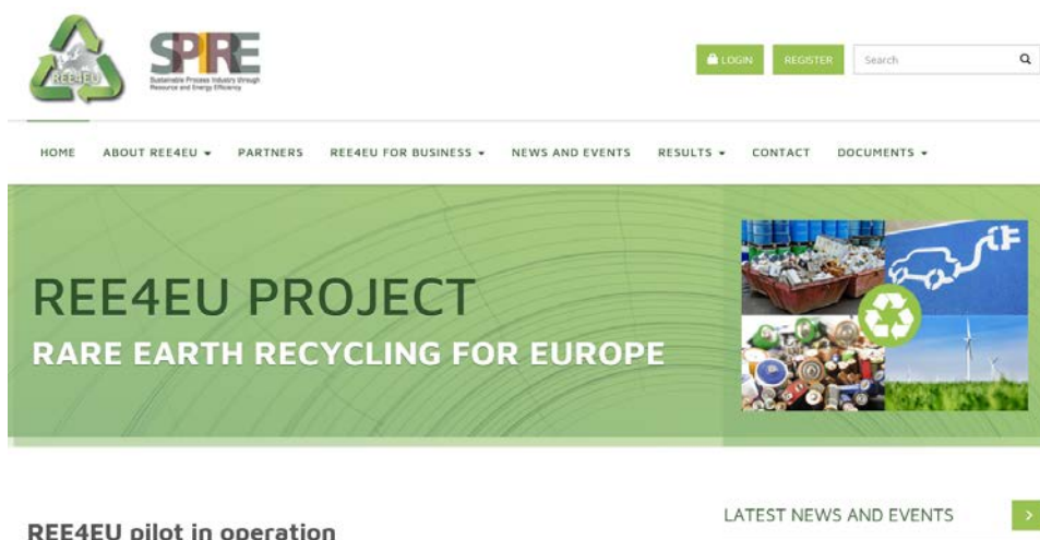
Figure 2. Snapshot of the REE4EU's project website, www.ree4eu.eu

The external project website was created and managed by partner PNO-Italy Ciaotech (third linked party of partner PNO-Innovation). The consortium took advantage of the often updates of "Events", gathering relevant Conferences and Workshops in the field of recycling, critical raw materials, etc. Likewise, partners informed the Co and the website responsible on events to be included in the website, usually at the consortium TELCOs.